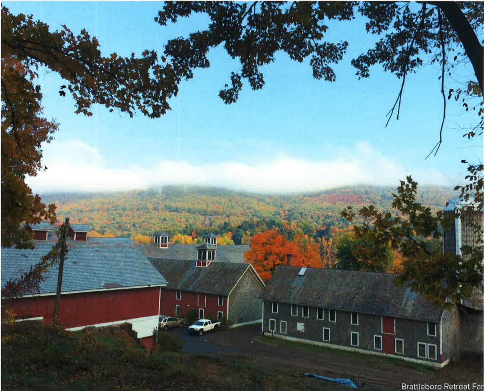
Brattleboro Retreat Farm

A working maple and hay operation of 30 acres, this farm complex includes five barns and a sugarhouse. The owner's great grandparents purchased the farm in 1901. Dairy operations ended in 1989. Grant funds will support work at the farm's large bank barn, comprised of two smaller barns that were moved to their current location by the Fullerton family during the early 20th century.