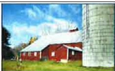
Mount Holly (Rutland) White Silo Farm - $11,500