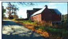
Hartland (Windsor) Three Beech Farm - $15,000

Originally a sheep farm, this 132-acre farm is protected by a conservation easement held by the Upper Valley Land Trust. It is an active organic farm producing eggs, chicken, turkey and grass-fed beef, with future plans to include fruit trees. Grant funds will support repairs to the barn's long shed, milk house, and high drive.