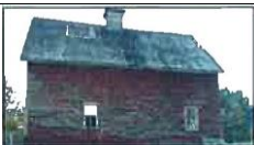
Middlesex (Washington) Barsch Barn - $5,000

Originally a sheep farm, this 132-acre farm is protected by a conservation easement held by the Upper Valley Land Trust. It is an active organic farm producing eggs, chicken, turkey and grass-fed beef, with future plans to include fruit trees. Grant funds will support repairs to the barn's long shed, milk house, and high drive.