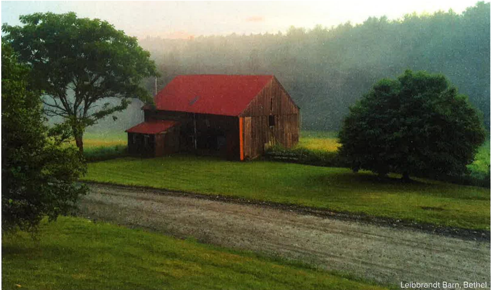
Leibbrandt Barn, Bethel